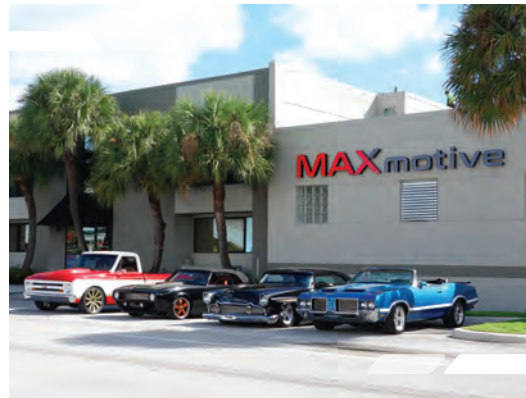
MAX Boca Raton 1800 NW 1st Court Boca Raton, Florida 33432