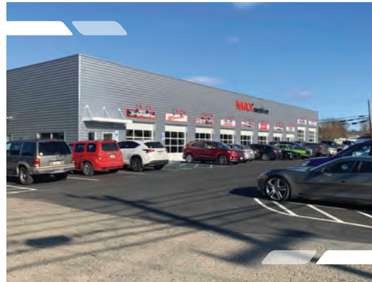
MAX Pittsburgh 1105 Pittsburgh St Cheswick, Pennsylvania 15024

MAXmotive has over 200 vehicles in stock between our Pittsburgh, PA & Boca Raton, FL locations. Vehicles are well maintained by our service staff and are available for display during normal hours or with a scheduled appointment.